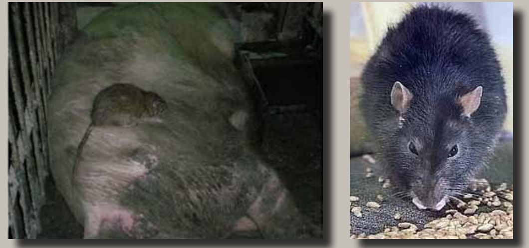
A rat will eat 15 grams/day so 1000 rats will eat over 5 tonne/year.

In Summary, There are lots of things that can be controlled on our pig farms to improve sanitation, feed and animal security. I always suggest securing and protecting what goes into your barn because you cannot protect what goes on outside the barn in your yard. Birds, rats, skunks, coons, blowing snow, and winds carrying disease etc, cannot be controlled. Changing coveralls, boots and washing hands before entering barns are shown to be very effective biosecurity methods. Keeping feed uncontaminated and clean will cut the risks of attracting rodents and acquiring something in your barn. Just plain old keeping things clean and enjoying working in a clean environment can improve your attitude, your staff's attitude and help improve your animals immune system with clean air and overall environment. Enjoy the festive season and the winter fun times, thank you.